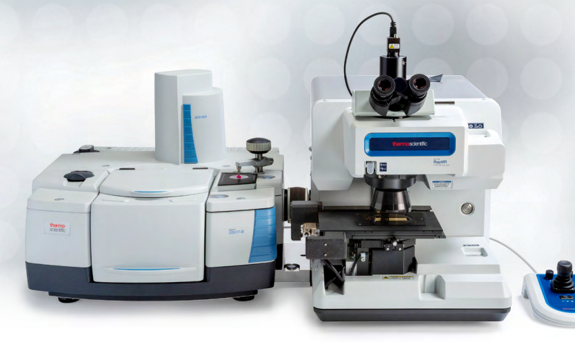
Nicolet iS50 FTIR Spectrometer